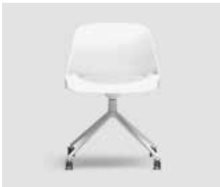
22 Office furnishings and office chairs