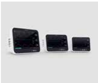
26 Life science and medicine