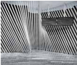
18 Interior design