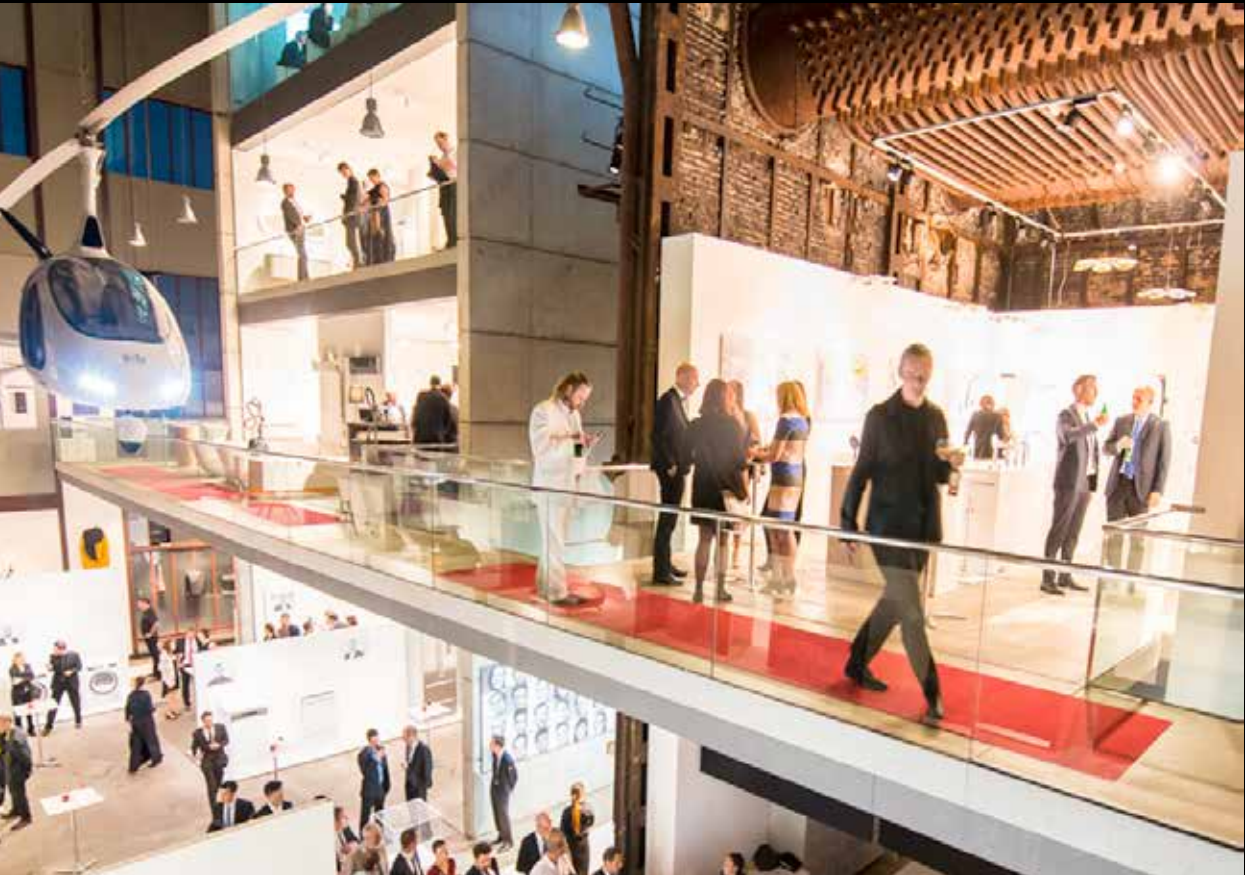
Contemporary product design amidst historical industrial culture: The Red Dot Design Museum Essen presents the winners against an extraordinary backdrop.

After the award ceremony approximately 1,400 international guests, among them design stars, CEOs and decision makers in marketing as well as representatives of international media, will meet at the Designers' Night at the Red Dot Design Museum in Essen, Germany, where the Red Dot winners are celebrated into the small hours. The after-show party is also the vernissage of the exclusive exhibition of winners.