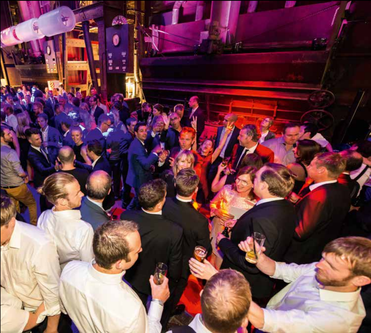
Celebrating in the midst of award-winning design: The vernissage of the winners' exhibition and the ensuing party flow seamlessly into one another at the Designers' Night.