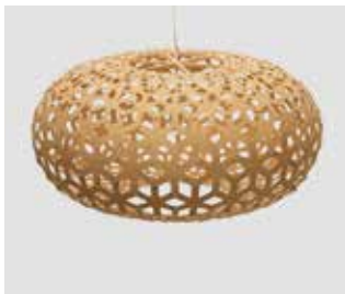
7 Lighting and lamps