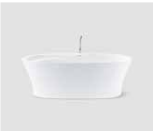
5 Bathrooms, spas and personal care