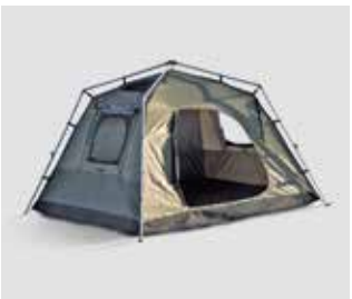
9 Outdoors, trekking and camping