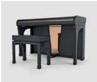
13 Musical instruments and equipment