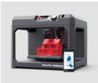
24 Industry, machinery and robotics