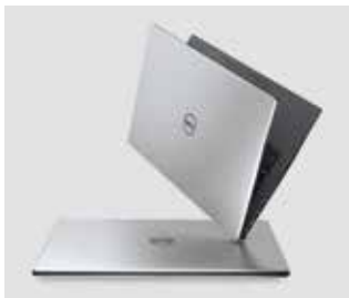
31 Computers and information technology