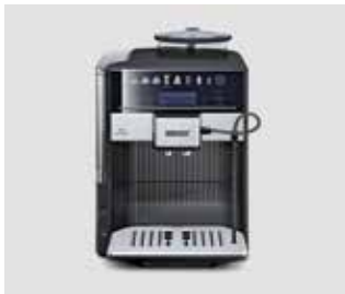
3 Kitchens, kitchen furnishings and kitchen appliances