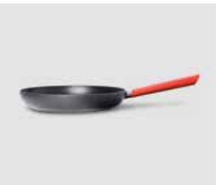
4 Tableware and cooking utensils