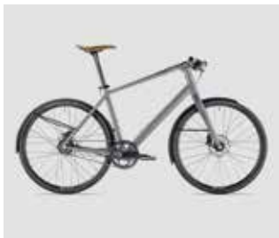
11 Bicycle and bicycle accessories