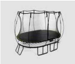
12 Leisure, games and fun