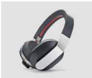
29 Consumer electronics and cameras