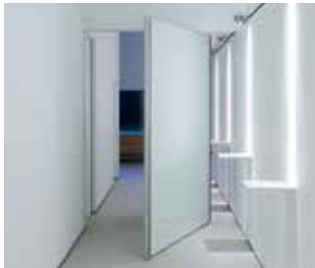
19 Interior design elements