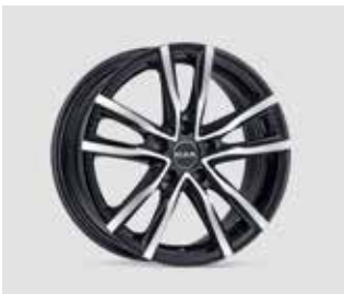
28 Vehicle accessories