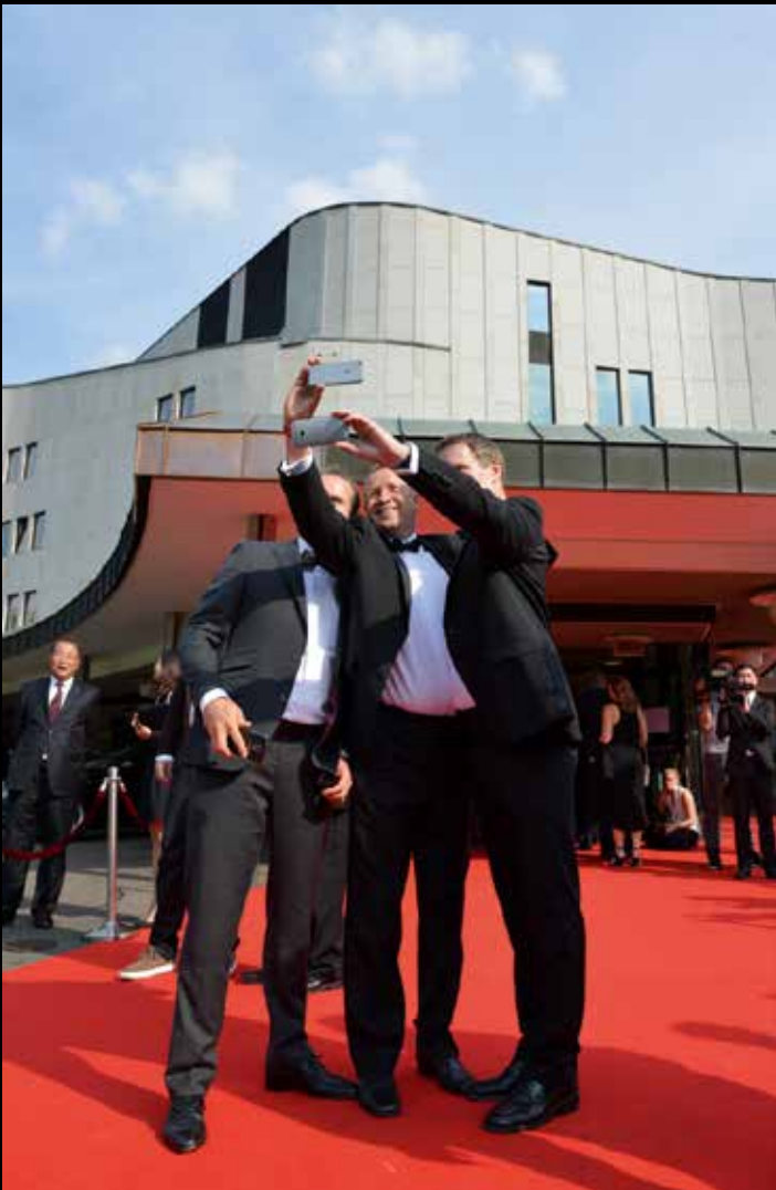
The red carpet stylishly sets the tone for an exceptional night.