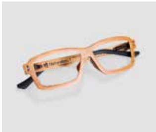
15 Fashion, lifestyle and accessories