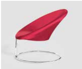
1 Living rooms and bedrooms