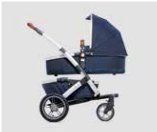
14 Babies and children