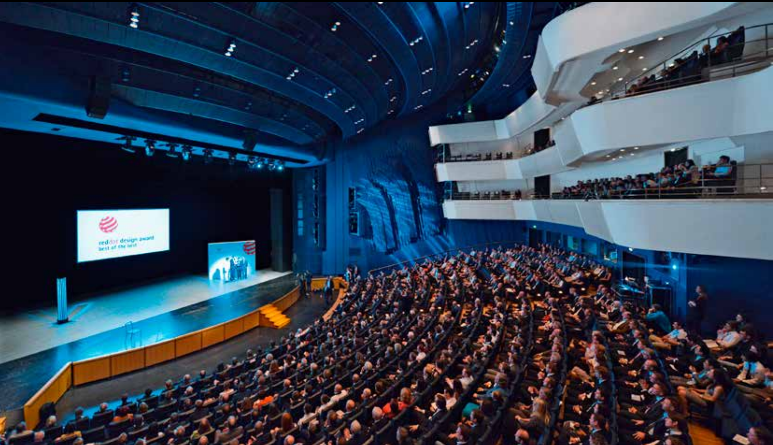
The Essen Aalto-Theater provides the glamorous setting for the festive award ceremony, the Red Dot Gala.

"Economic success is based on good design and its communication. Receiving a distinction at the Red Dot Award confirms the quality of a product and communicates its success in a contemporary way, thus setting it apart from the masses."