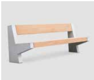
21 Urban design and public spaces