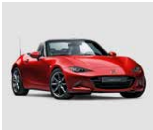
27 Vehicles (land, water and aerospace)