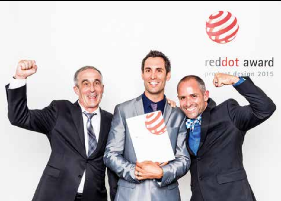
The Red Dot and Honourable Mention winners receive their deserved certificates at the Designers' Night.