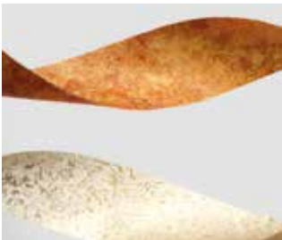
20 Materials and surfaces