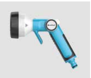
8 Garden furnishings, garden and BBQs