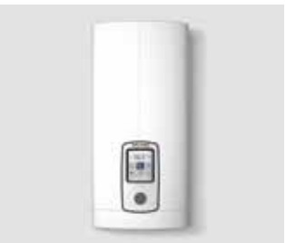
6 Heating and air conditioning technology