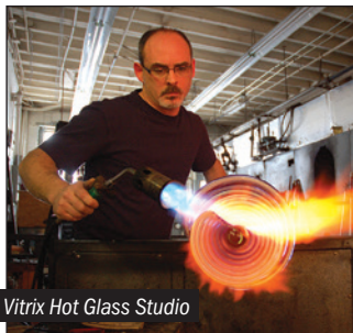
Vitrix Hot Glass Studio