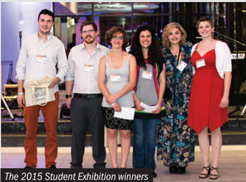
The 2015 Student Exhibition winners

Sales: We encourage sales at this event, by Visa/ MasterCard, cash, or check made directly to GAS on Friday evening or Saturday by 2 pm. Artists will receive 80%. Buyers must make their own arrangements for shipping purchased work.