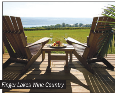
Finger Lakes Wine Country

www.westendgallery.net West End Gallery is a family-owned and operated gallery celebrating 38 years in business, featuring two floors of representational art by more than 40 exceptional artists.