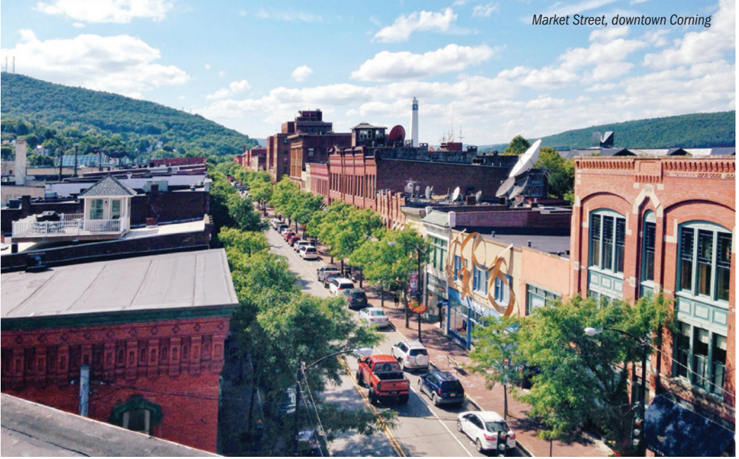
Market Street, downtown Corning

For additional travel information, visit www.glassart.org/2016_Travel_and_Lodging.html