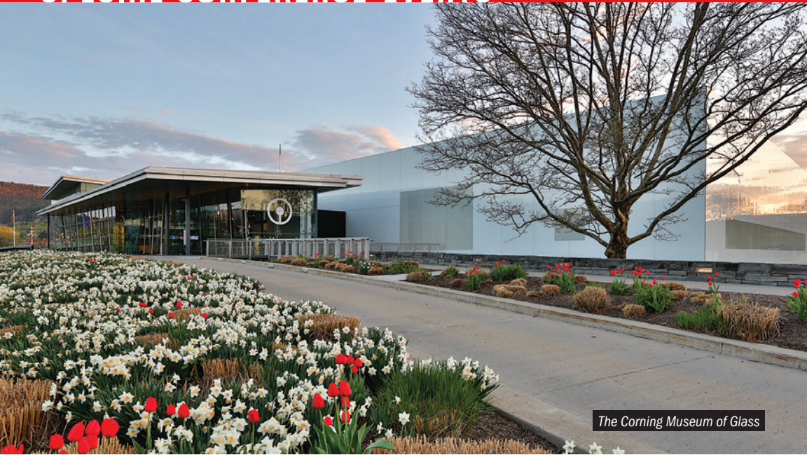
The Corning Museum of Glass