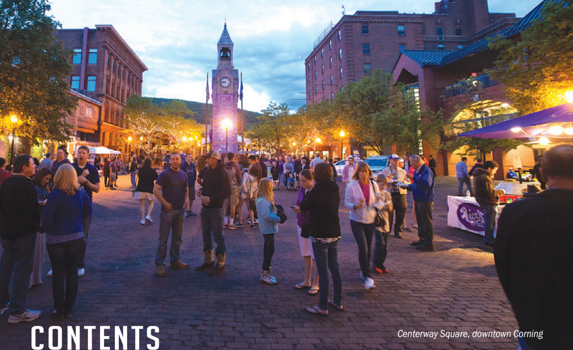
Centerway Square, downtown Corning