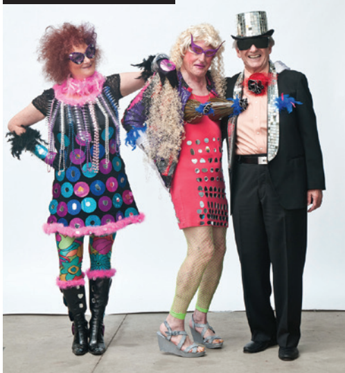
The 2012 Glass Fashion Show

Check for updates on the Closing Night Party at www.glassart.org/Closing_Night_Party.html .