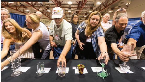
The 2015 Goblet Grab

Send proposals to: Sarah Blood, 2 Pine Street, Alfred NY 14802 / blood@alfred.edu