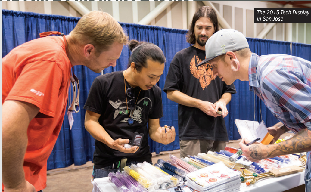
The 2015 Tech Display in San Jose