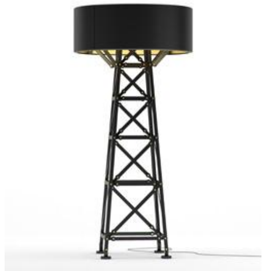
Construction Lamp matt black

The Construction Lamps are available in matt black and white combined with wood.