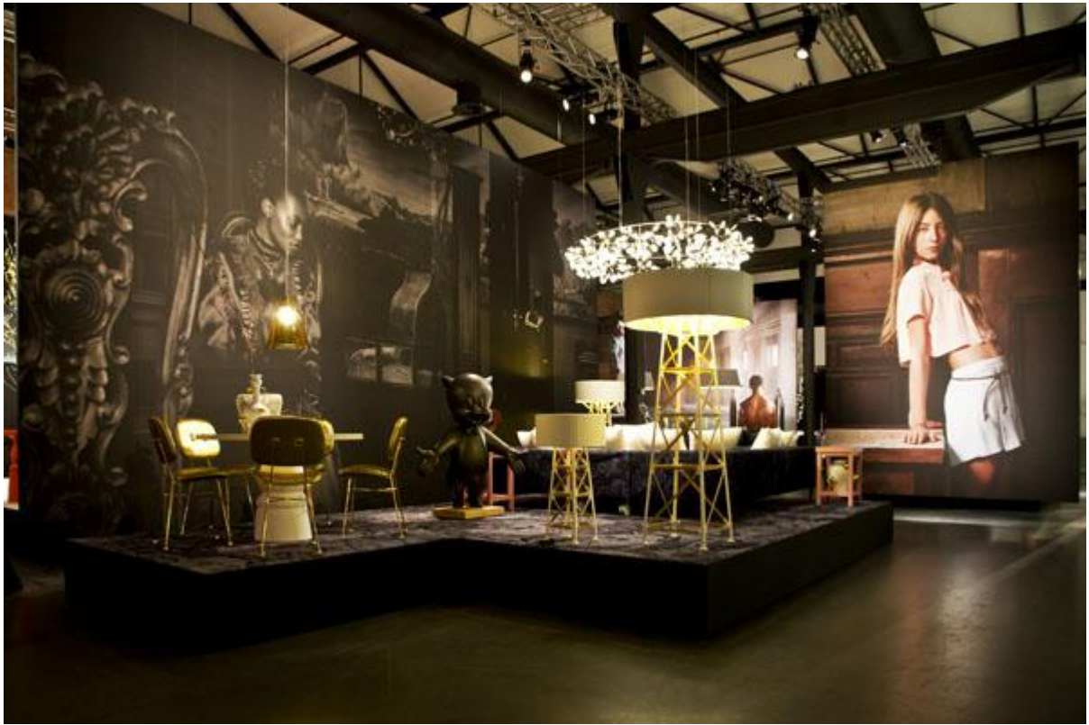
Moooi new collection presentation during Salone del Mobile 2013 at via Savona 56, Milan

'Working with the team at MOOOI was a fantastic experience. Their production capacity and their level of quality is so high, that we were able to push each other to new heights!'